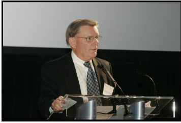
MHCC Chair Michael Kirby speaks to the audience about the Commission during MIAW

The Mental Health Commission of Canada was a key participant at this year's Mental Health Awareness Week in Ottawa in